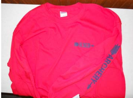
Long Sleeve T-shirt with arrow on sleeve

This shirt comes in red, white, and light gray. If you want one see any board member or league chairman.